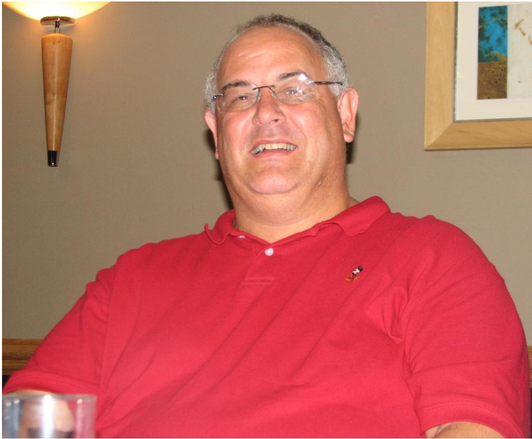
One of the “Good!” Guys ...

Congress then approved a Special Application by CZE for World Cup XII Postal Final to be an international title event.